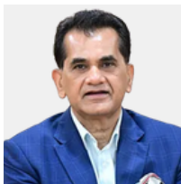
Shri. Amitabh Kant